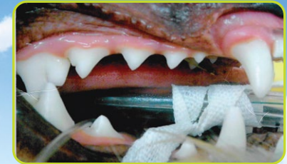
Grade 0 (normal)